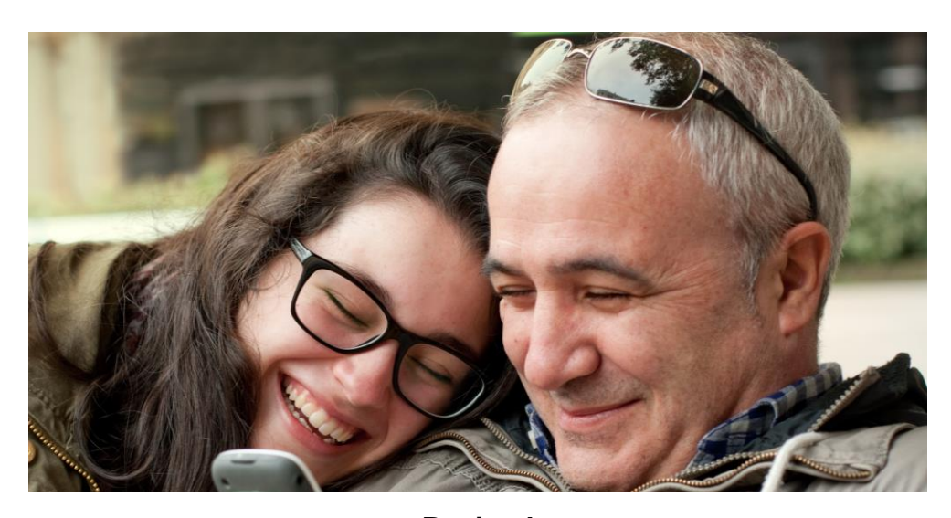
Revised January 2022

St Christopher's Fellowship, Registered Office: 1 Putney High Street, London SW15 1SZ T: 020 8780 7800 www.stchris.org.uk